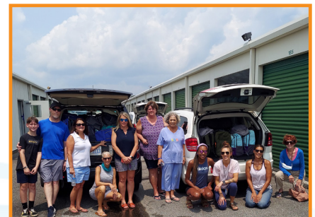
WAVES 4 K.I.D.S.

ATMC has awarded upwards of $845,000 over the years to hundreds of unique programs. For more information on ATMC's involvement in the community, visit atmc.com/communitygrants .