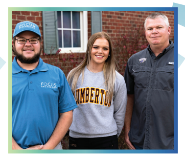
FOCUS Broadband's first customer in Robeson County

For more information on service availability in Robeson County, visit fasterrobeson.com.