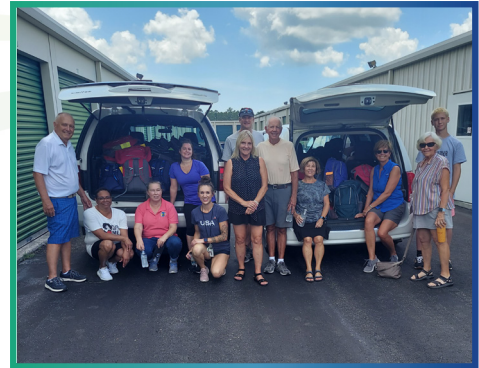
WAVES 4 K.I.D.S. Board Members deliver 200 backpacks

FOCUS Broadband has awarded over $1 million in community and education grants since its inception in 2006.