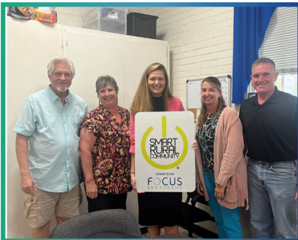
Town of Atkinson Commissioners

The Town of Atkinson is the newest recipient of the Smart Rural Community designation presented by FOCUS Broadband. The Smart Rural Community designation highlights projects which make rural communities vibrant places to live and do business through the implementation of innovative broadband-enabled solutions.